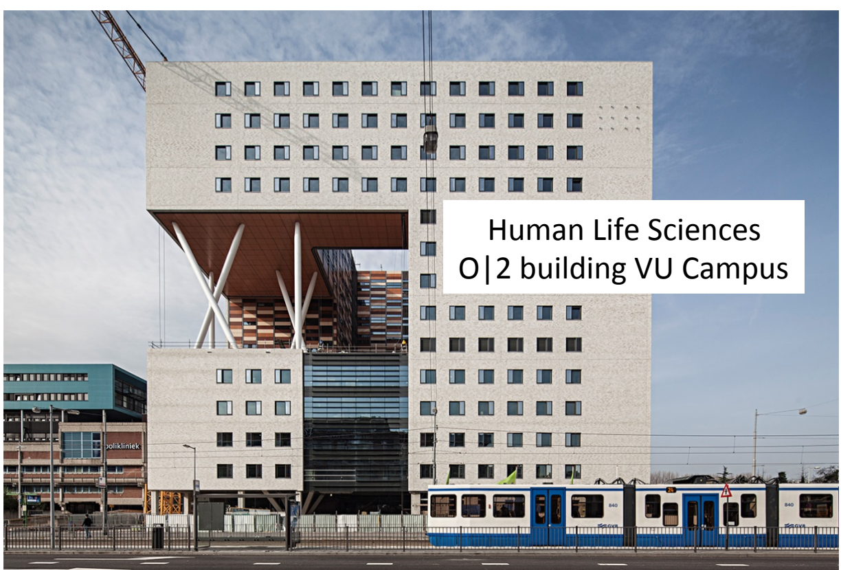
Human Life Sciences O|2 building VU Campus